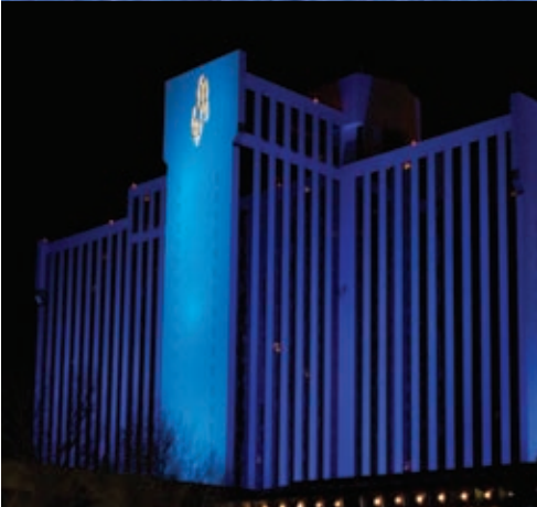
GRAND SIERRA RESORT