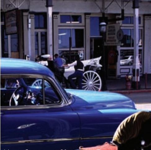
MAIN STREET IN VIRGINIA CITY