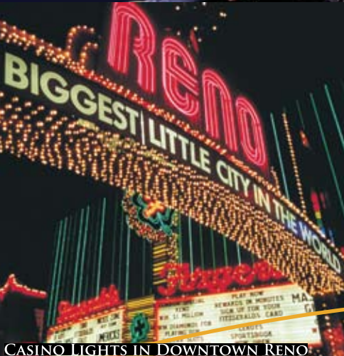
CASINO LIGHTS IN DOWNTOWN RENO

The 2010 Conference Committee is seeking support from its sister states within Region VIII. The activities and events listed below are currently being planned. Please consider a contribution to or sponsorship of an event!