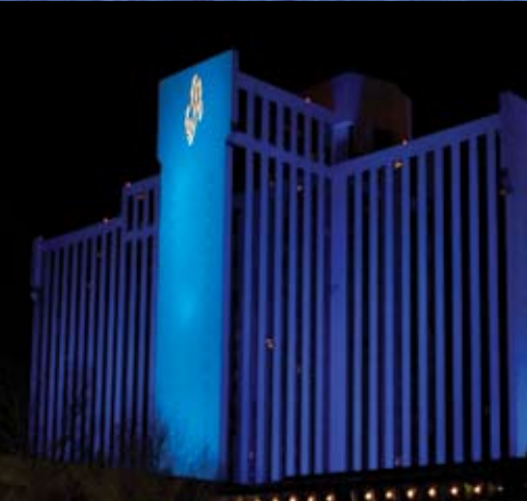
GRAND SIERRA RESORT