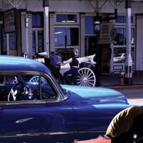
MAIN STREET IN VIRGINIA CITY